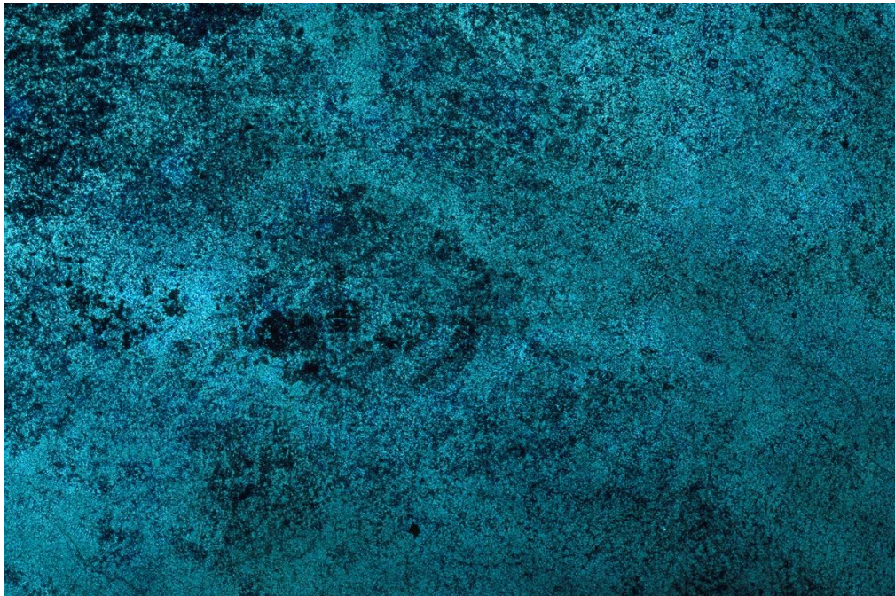
Circadian Maps/ Iron (detail) 35mm negative treated with iron toner, (original 140x60), 2015