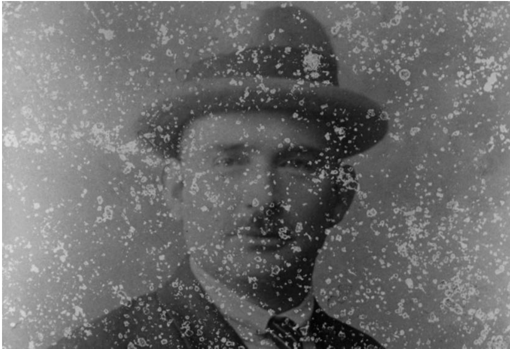
Buried Portrait, 5 iterations 20x25 cm, series of B&W prints exposed to soil, 2014