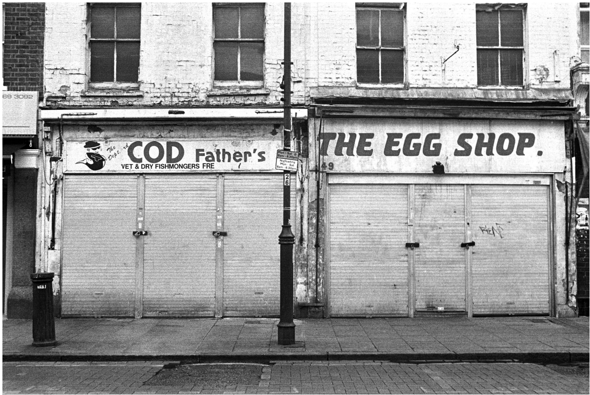
Shop fronts on Deptford High Street, Photo by Anita Strasser, 2011