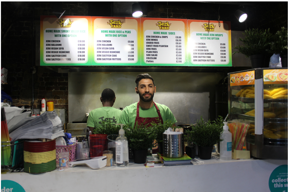
Guys at Jerk Yard, Arch 10, 4 Deptford Market Yard, Photo by Mark Shackleton, 2022