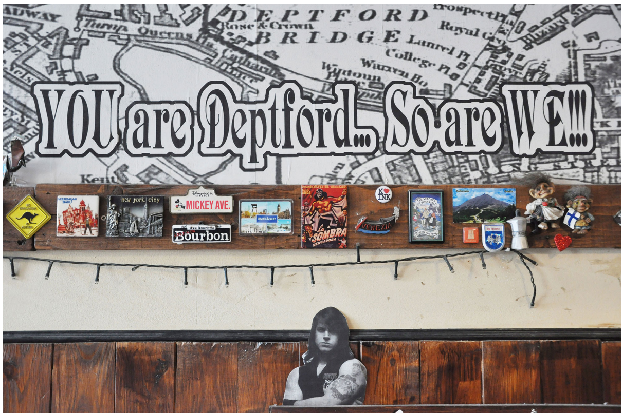
Detail in The Waiting Room café, Photo by Anita Strasser, 2018