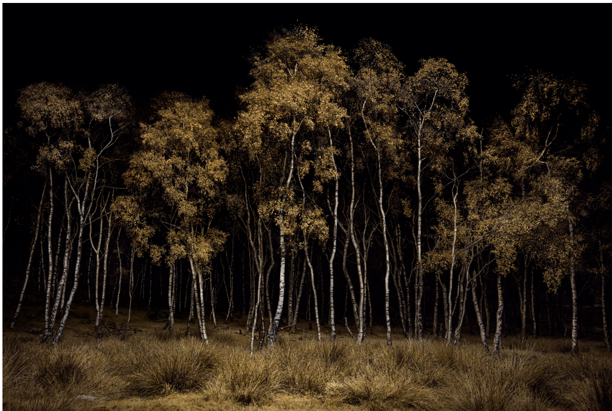
Twilight #20, Birch Wood, 2020